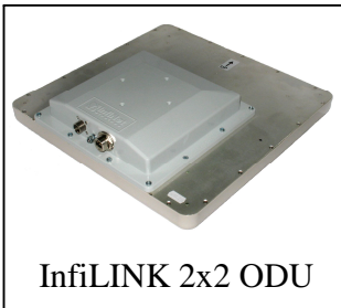
InfiLINK 2x2 ODU