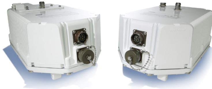
Figure 1. Cisco Aironet 1500 Series

The Cisco Aironet 1500 Series supports options for dual-band, simultaneous support for IEEE 802.11a and 802.11b/g standards with the 1510 model or single-band support for IEEE 802.11b/g with the 1505 model. Both models employ Cisco's patent-pending Adaptive Wireless Path Protocol (AWPP) to form a dynamic wireless mesh network between remote access points, while delivering secure, high-capacity wireless access to any Wi-Fi-compliant client device (Figure 2).